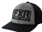
GREY HEATHER/BLACK 201918-0710-