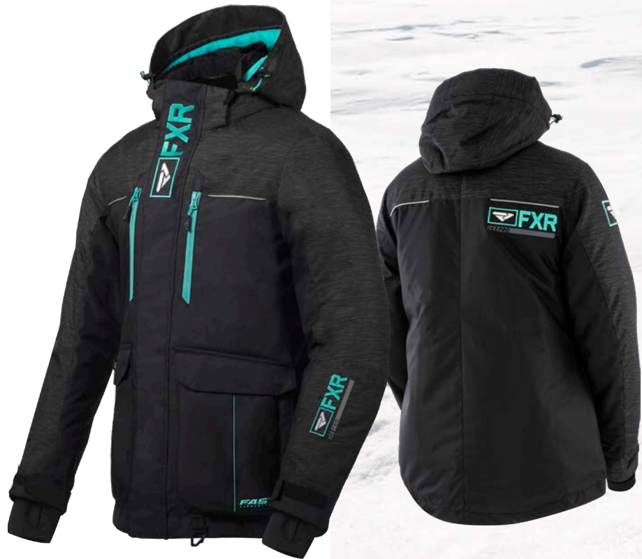
BLACK/CHAR JERSEY/MINT 200212-1006-