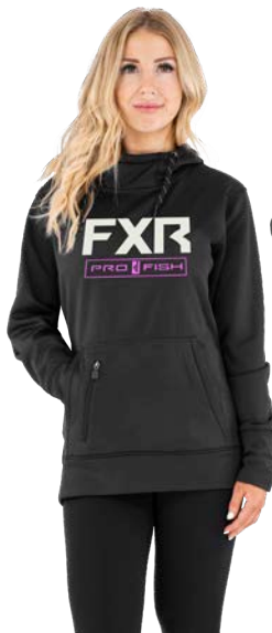
BLACK/E PINK 211244-1094-