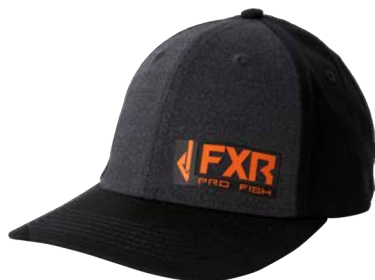
CHAR HEATHER/ORANGE 201917-0630-