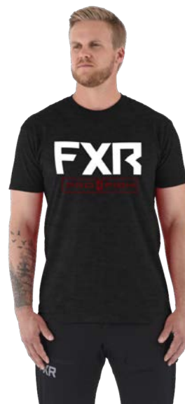
CHAR HEATHER/RUST 211329-0637-