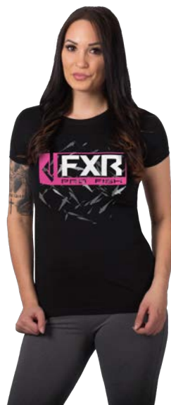
* BLACK/E PINK 211414-1094-