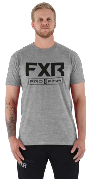
GREY HEATHER/BLACK 211329-0710-