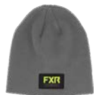
GREY HEATHER/HI-VIS 211609-0765-