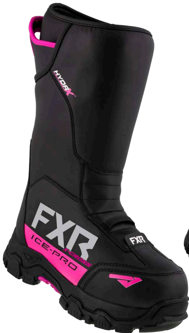
* BLACK/FUCHSIA 210709-1090-