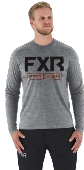
GREY HEATHER/RUST 211327-0737-