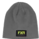
GREY HEATHER/HI-VIS 211609-0765-