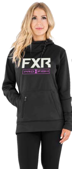
BLACK/E PINK 211244-1094-