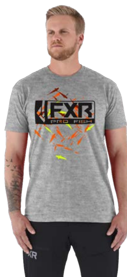
GREY HEATHER/BLACK 211322-0710-