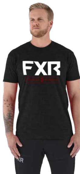
CHAR HEATHER/RUST 211329-0637-