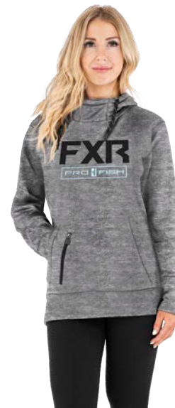
GREY HEATHER/SKY BLUE 211244-0753-