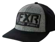
GREY HEATHER/BLACK 201918-0710-