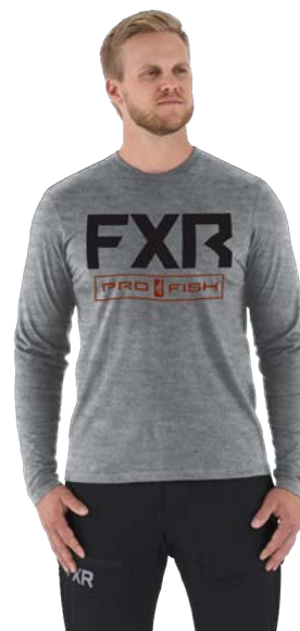
GREY HEATHER/RUST 211327-0737-