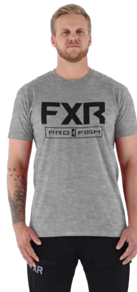
GREY HEATHER/BLACK 211329-0710-