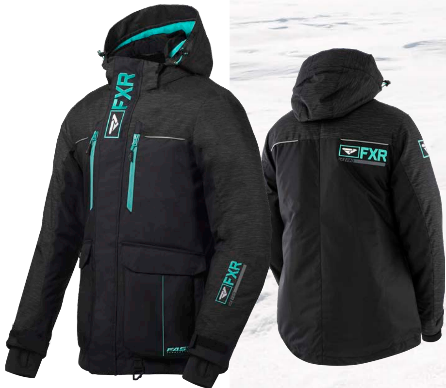
BLACK/CHAR JERSEY/MINT 200212-1006-