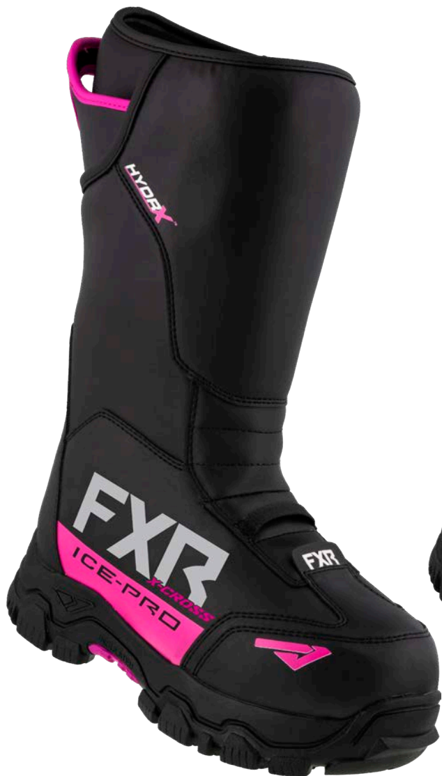
* BLACK/FUCHSIA 210709-1090-