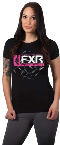
* BLACK/E PINK 211414-1094-