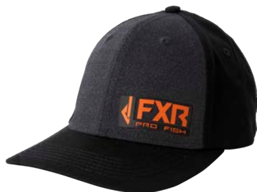
CHAR HEATHER/ORANGE 201917-0630-