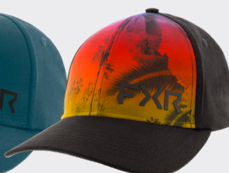
TROPICAL / BLACK 231941-9710