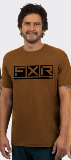
COPPER / BLACK 232071-1910