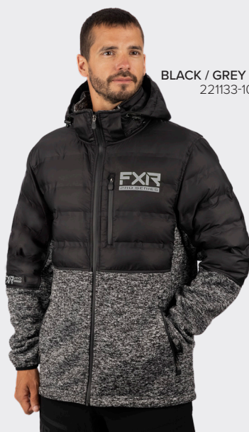
BLACK / GREY HEATHER 221133-1007