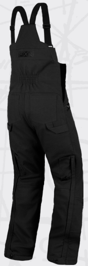
BLACK OPS 210935-1010