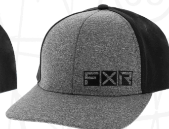
GREY HEATHER / BLACK 231940-0710