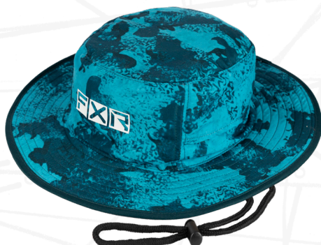
BLUE CAMO / WHITE 221947-4101