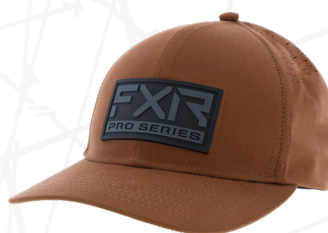
COPPER / BLACK 231912-1910