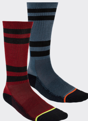
STEEL / RUST 211651-0337