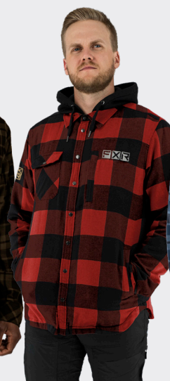
RUST / BLACK 231117-3710