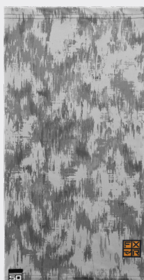
GREY FIBER 231954-0700