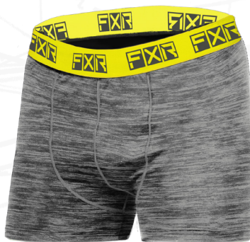
GREY HEATHER / HIVIS 211346-0765