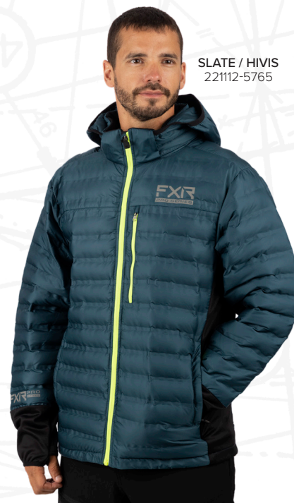
SLATE / HIVIS 221112-5765