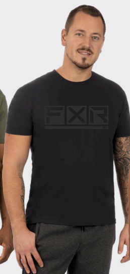
BLACK OPS 232071-1010