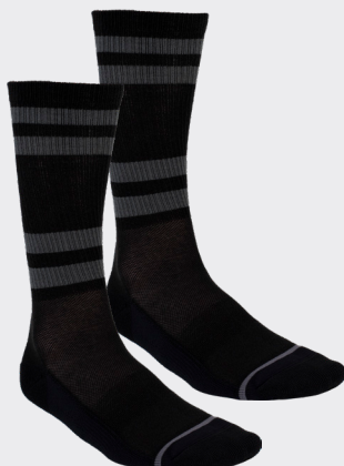
BLACK OPS 211651-1010