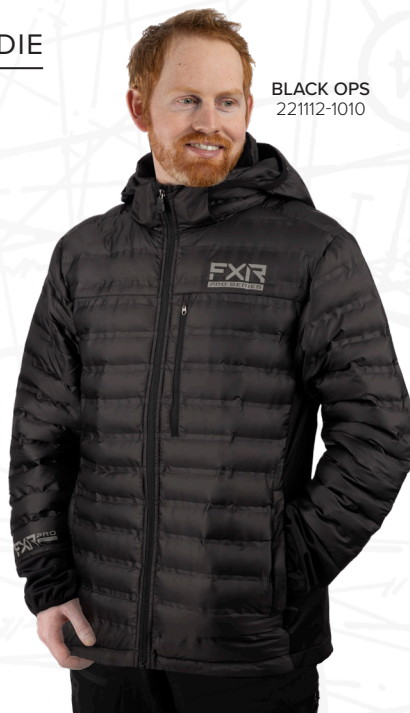
BLACK OPS 221112-1010