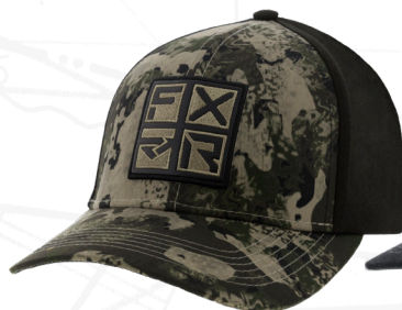
ARMY CAMO / BLACK 221641-7610