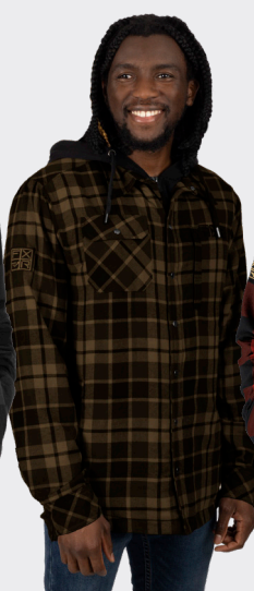
BRONZE / BLACK 231117-3810