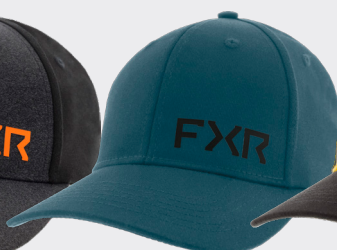
DARK STEEL / BLACK 231941-0310