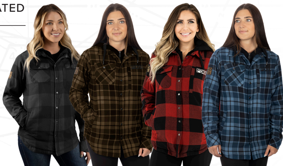
CHARCOAL / BLACK 231117-0810*