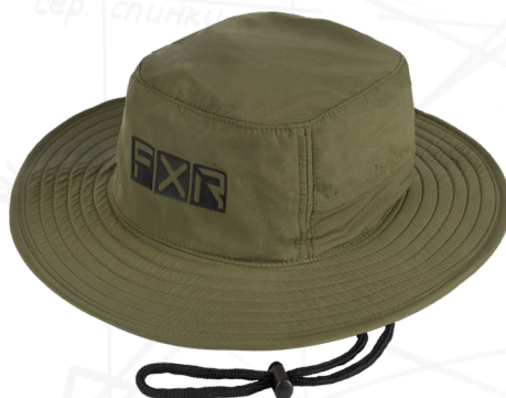
ARMY / BLACK 221947-7510