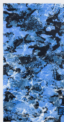
BLUE RIPPLE 231954-4100