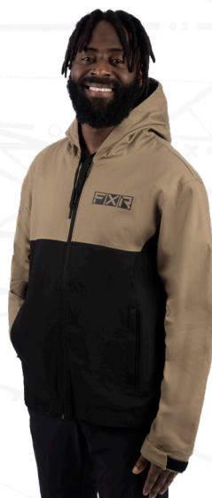
CANVAS / BLACK 222060-1510