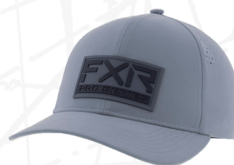
GREY / ASPHALT 231912-0508