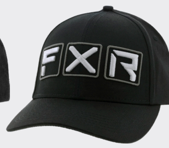
BLACK / WHITE 231644-1001