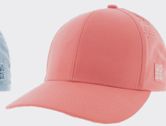
MUTED MELON 231913-9300