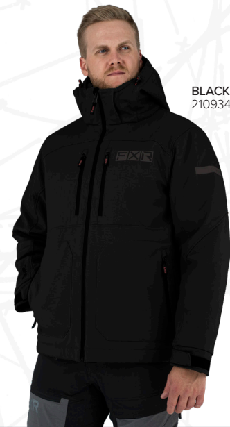
BLACK OPS 210934-1010