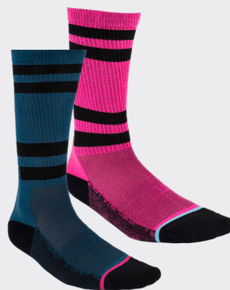
ELEC PINK / OCEAN 211651-9448