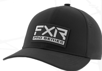
BLACK / GREY 231912-1005