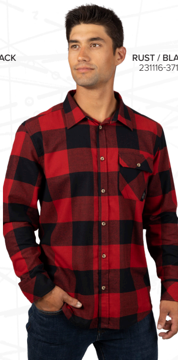
RUST / BLACK 231116-3710