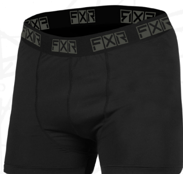
BLACK OPS 211346-1010