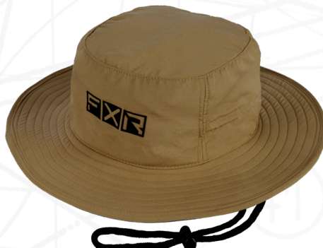
CANVAS / BLACK 221947-1510