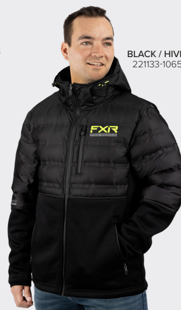
BLACK / HIVIS 221133-1065