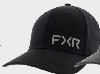
BLACK / GREY 231941-1005