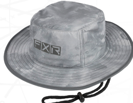
GREY INK / CHAR 221947-0708