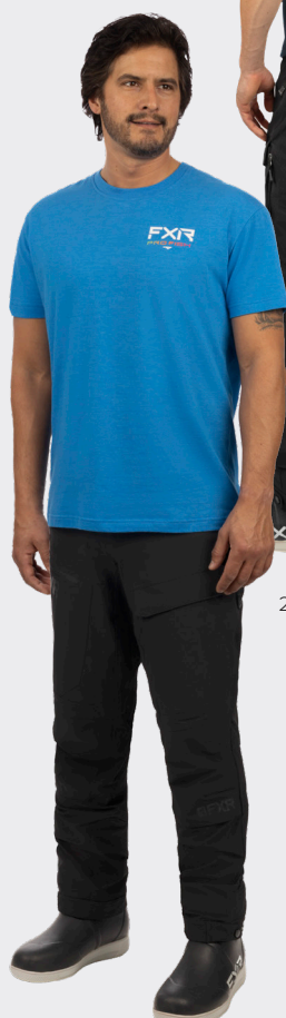
BLACK OPS 200920-1010*