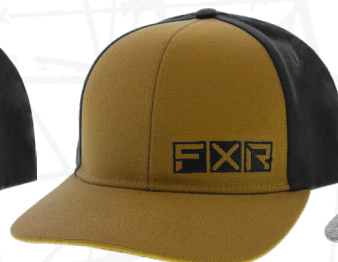
CANVAS / BLACK 231940-1510