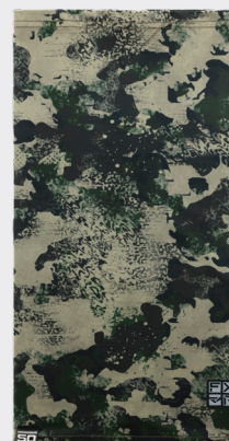
ARMY CAMO 231954-7600