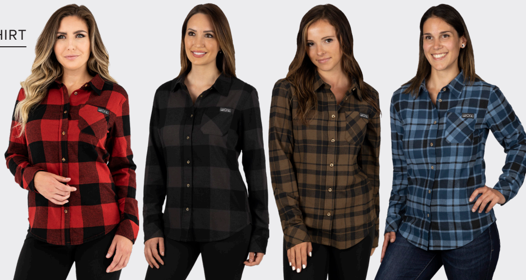
RUST / BLACK 231209-3710