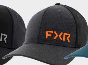
CHAR HEATHER / ORANGE 231941-0630