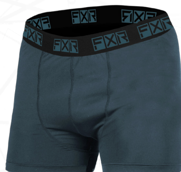
STEEL / BLACK 211346-0310