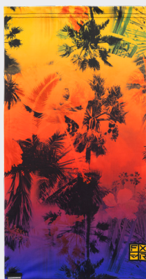
ANODIZED TROPICAL 231954-2397