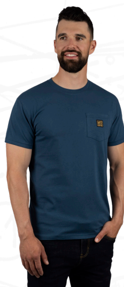
DARK STEEL 231300-0300