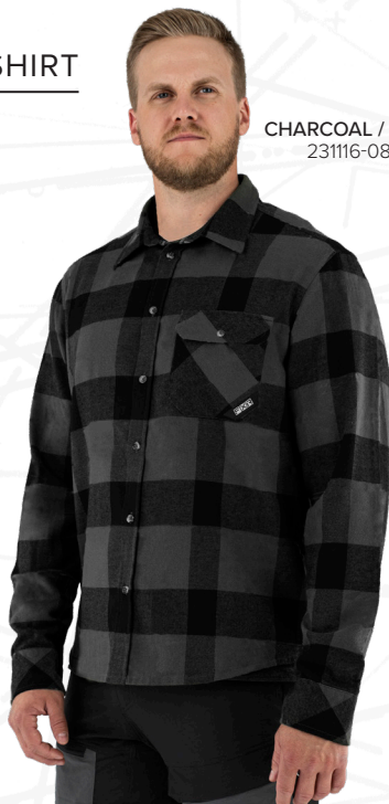
CHARCOAL / BLACK 231116-0810