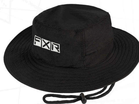
BLACK / WHITE 221947-1001