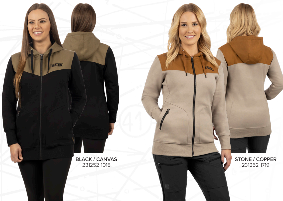
BLACK / CANVAS 231252-1015