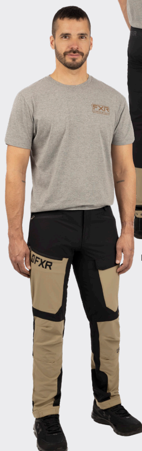
BLACK / CANVAS 200920-1015