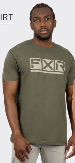
ARMY / STONE 232071-7517