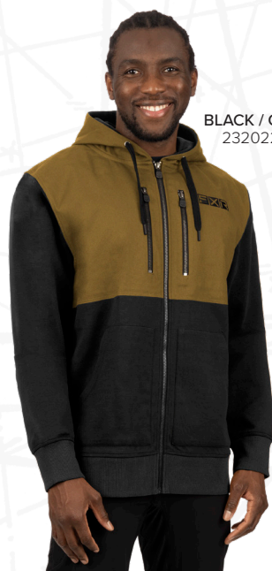
BLACK / CANVAS 232022-1015