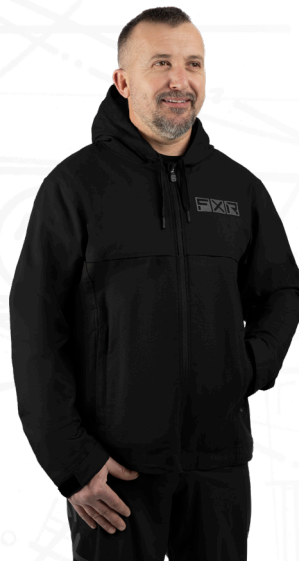
BLACK OPS 222060-1010