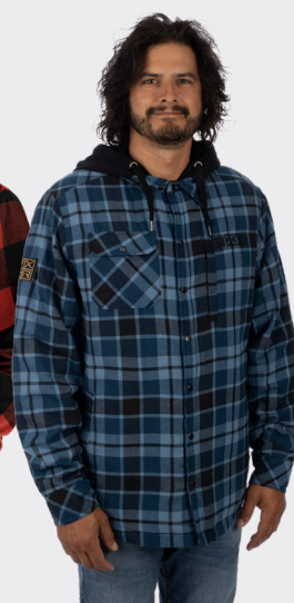
STEEL / SLATE 231117-0357