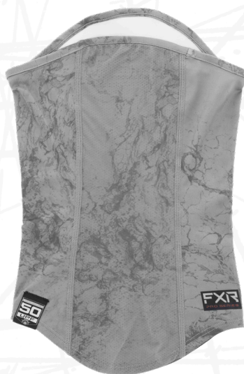
GREY RIPPLE 231953-0700