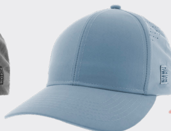
LT STEEL 231913-0300