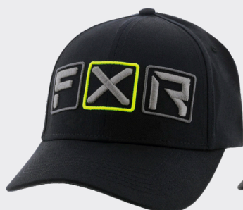
BLACK / HIVIS 231644-1065