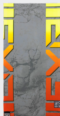
GREY RIPPLE / INFERNO 231954-0726