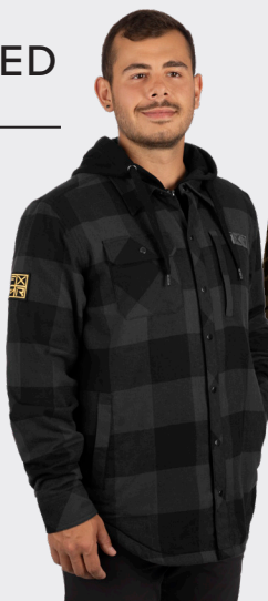
CHARCOAL / BLACK 231117-0810*