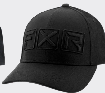
BLACK OPS 231644-1010