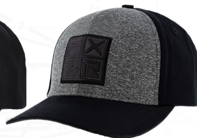
GREY HEATHER / BLACK 221641-0710