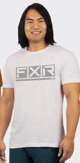
WHITE / GREY 232071-0105