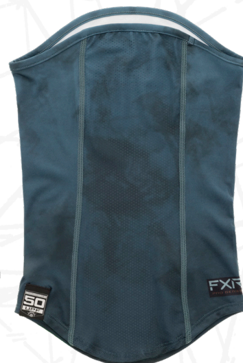
STEEL CAMO 231953-0300