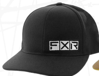
BLACK / WHITE 231940-1001