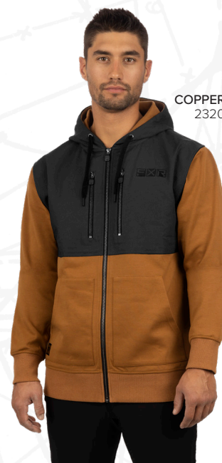
COPPER / ASPHALT 232022-1908