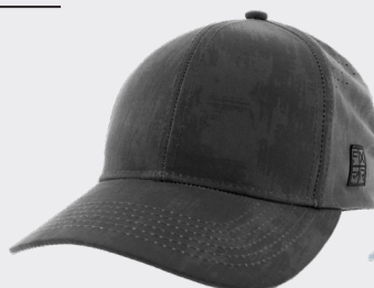
BLACK FIBER 231913-1100